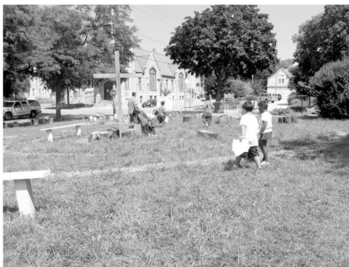
Figure 2: Children participate in a lesson at All People's Garden, July 2010

The first garden in Harambee was founded in 1992 by the neighborhood's All People's Church to provide educational space for the church's youth programs. The church maintained All People's Garden with an annual permit from the City of Milwaukee until 2005, when the city revoked the permit and evicted the garden with intent to commercially develop the land. This goal never materialized and the former garden became an abandoned space. In 2008, residents led by All People's Church reclaimed the space and rebuilt the garden. Church members added a cross to the rebuilt garden to reflect its importance as a religious space for church members (see Figure 2). All People's pastor conceives the rebuilding of the garden as "an act of civil disobedience" proclaiming "that we are not going to let the city call this a vacant lot" (personal communication). 1 The City eventually acknowledged this status by providing a new permit for gardening, and the garden thrives once again. By reclaiming control over the space and returning it to its original use and