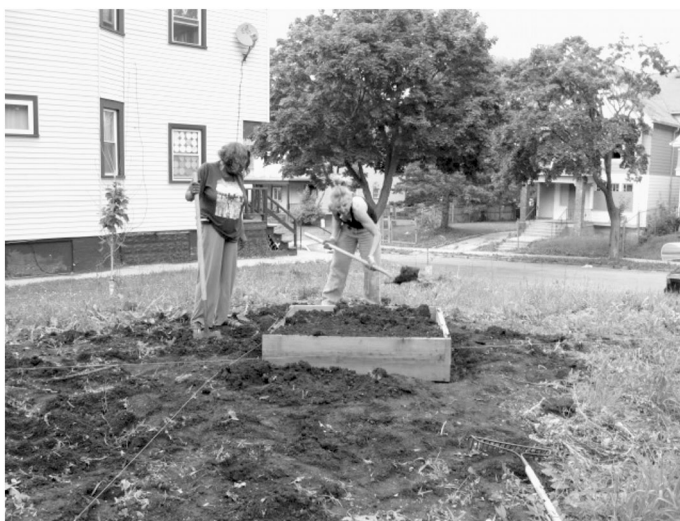
Figure 3: Volunteers build raised beds at Grow and Play Garden, June 2010

Harambee gardens provide opportunities for resident leadership and decision-making, as their development has depended largely on the leadership and participation of citizen volunteers, who are mostly neighborhood residents (see Table 1). Volunteers decide how to assign responsibility for garden work, what to plant in garden beds, and how to distribute garden produce. Volunteers organize workdays, transport garden tools, raise funds, and perform regular maintenance tasks, such as shoveling snow and mowing grass. Nigella Commons Garden, for example, is led by two female residents, who write grant applications to solicit funding, store tools at their homes, and organize regular group workdays at the garden. All People’s Garden is deeply rooted in the neighborhood, as the church and garden are an established neighborhood community site where residents interact. Participation and leadership in the development of gardens represents an important step for Harambee citizens in gaining control of their built landscape and engaging in localized political activities.